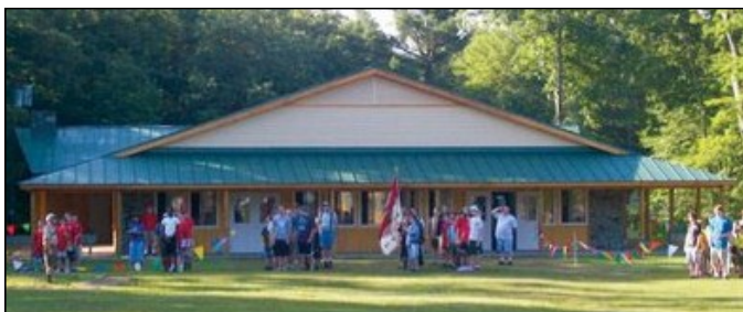
Sir John Templeton Dining Hall/Resica Falls